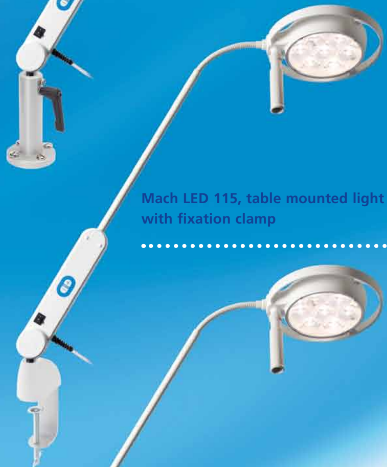
Mach LED 115, table mounted light with fixation clamp