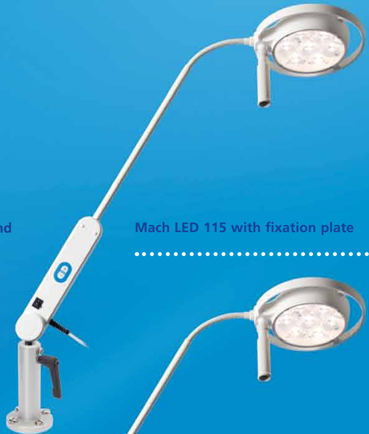
Mach LED 115 with fixation plate