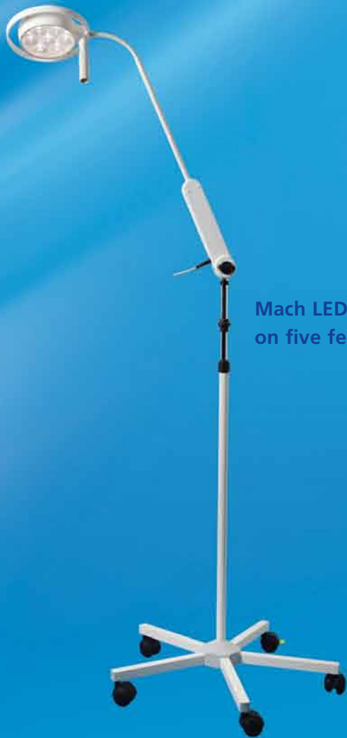
Mach LED 115 on five feet mobile stand