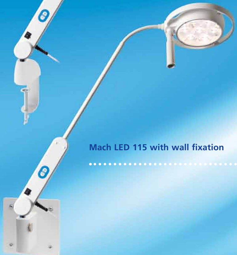
Mach LED 115 with wall fixation